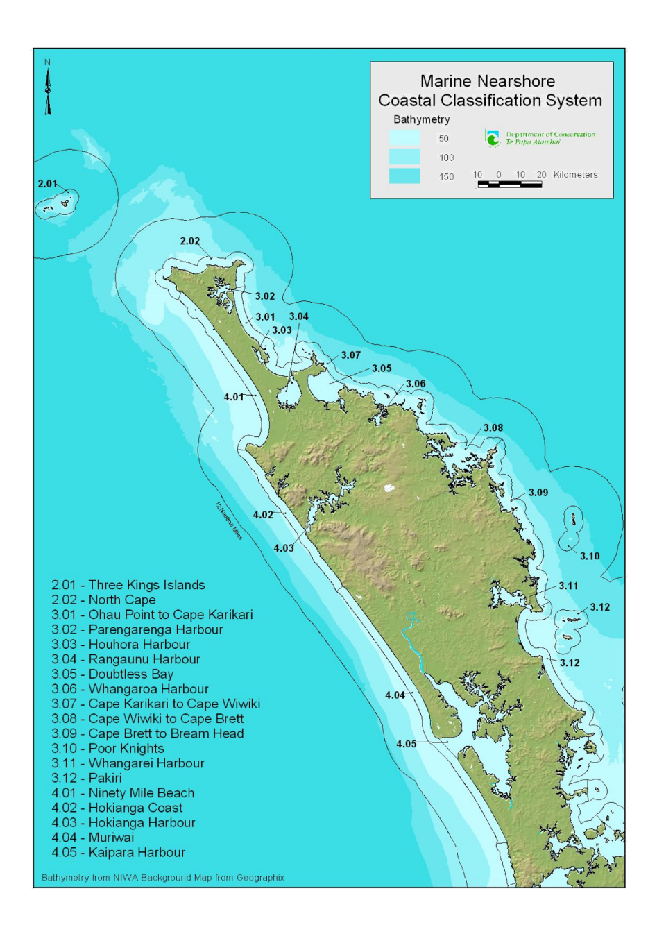
Figure 2 Marine Nearshore Coastal Classification System

the Northland coast including the estuaries, with the larger estuaries each constituting one coastal unit. See Figure 2.